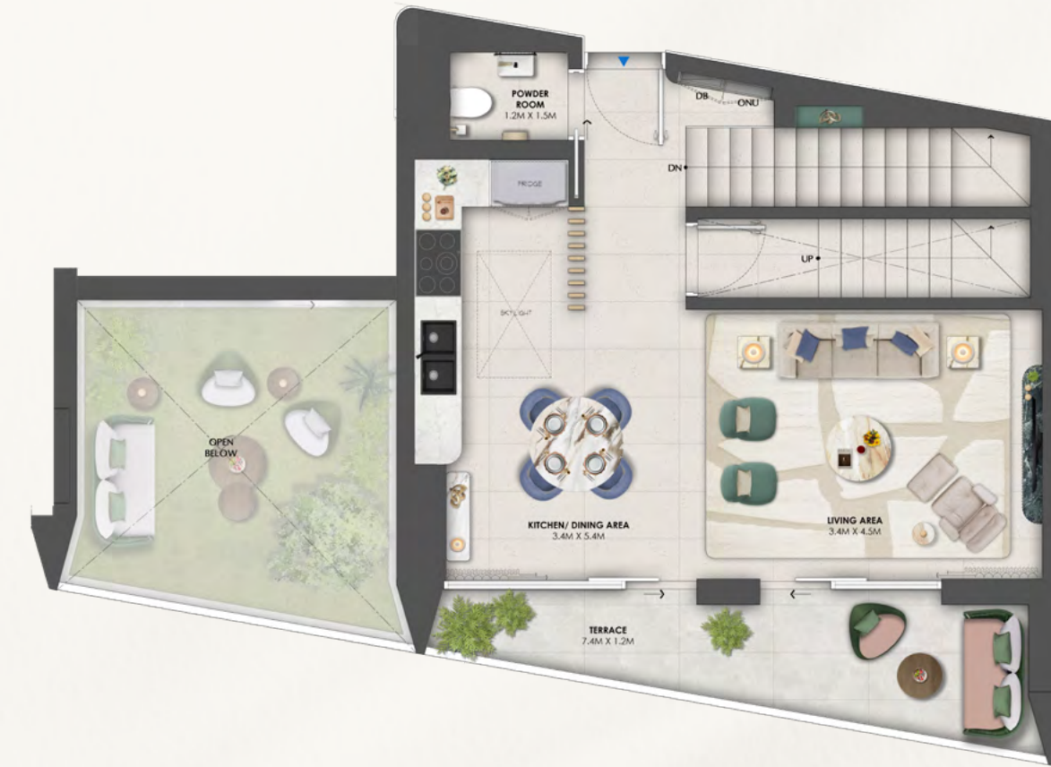
UPPER FLOOR (ENTRY LEVEL)