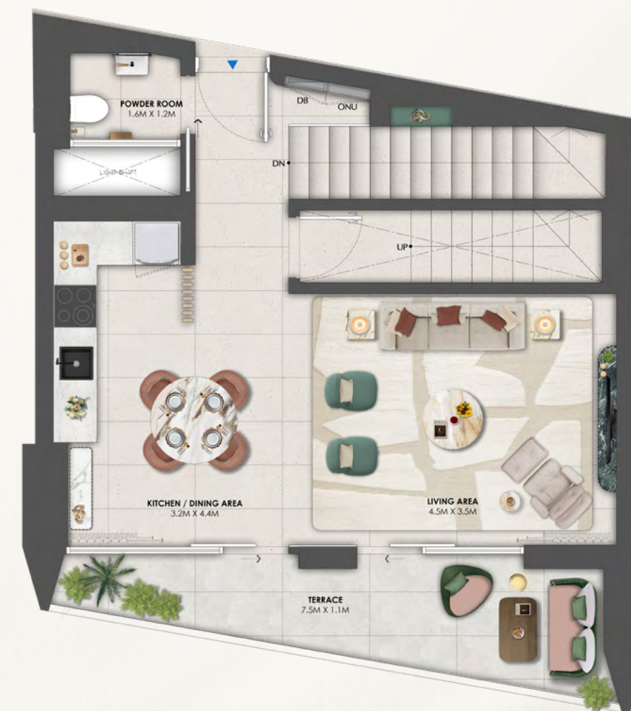
UPPER FLOOR (ENTRY LEVEL)